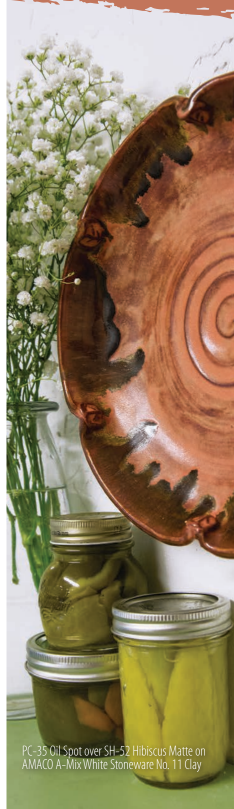
PC-35 Oil Spot over SH-52 Hibiscus Matte on AMACO A-Mix White Stoneware No. 11 Clay

Join the conversation www.facebook.com/groups/potterschoiceex