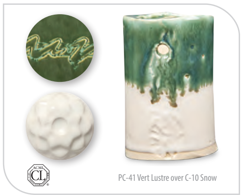
PC-41 Vert Lustre over C-10 Snow