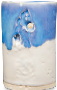
PC-21 Arctic Blue over C-10 Snow