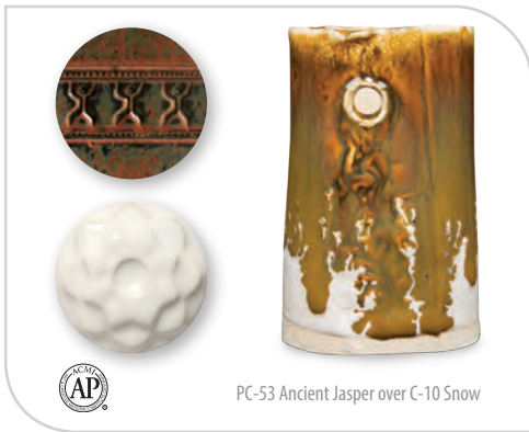
PC-53 Ancient Jasper over C-10 Snow