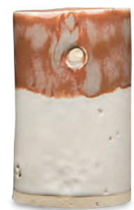
PC-34 Light Sepia over C-10 Snow