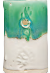
PC-25 Textured Turquoise over C-10 Snow