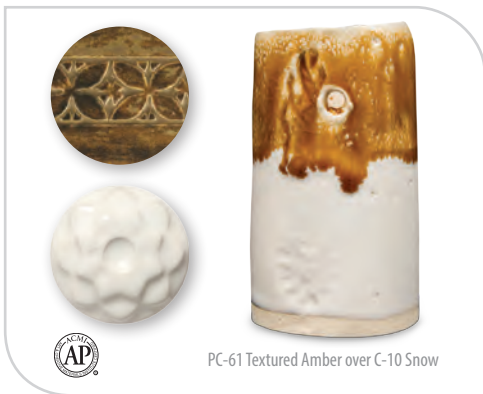
PC-61 Textured Amber over C-10 Snow