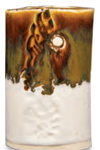
PC-36 Ironstone over C-10 Snow