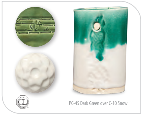
PC-45 Dark Green over C-10 Snow