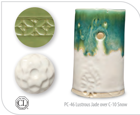
PC-46 Lustrous Jade over C-10 Snow