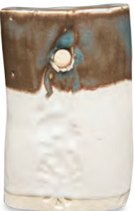
PC-27 Tourmaline over C-10 Snow