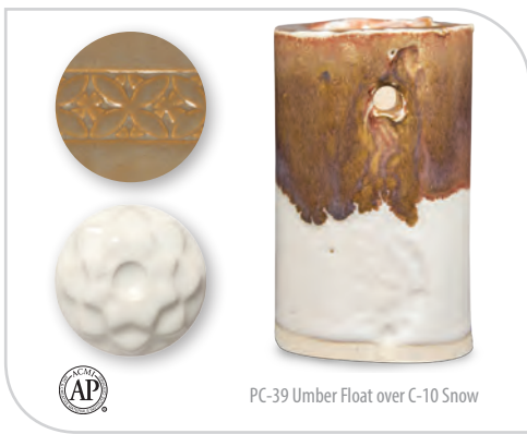
PC-39 Umber Float over C-10 Snow