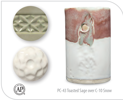
PC-43 Toasted Sage over C-10 Snow