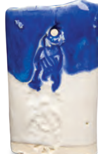
PC-23 Indigo Float over C-10 Snow