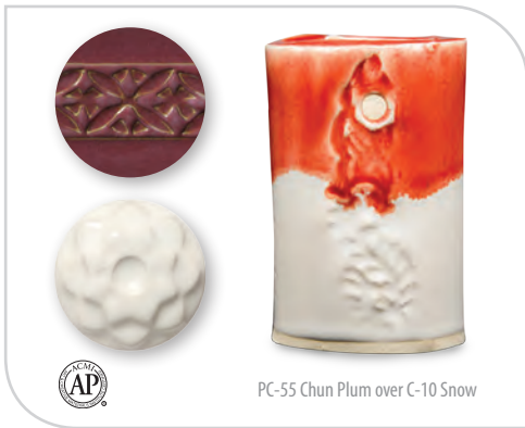
PC-55 Chun Plum over C-10 Snow