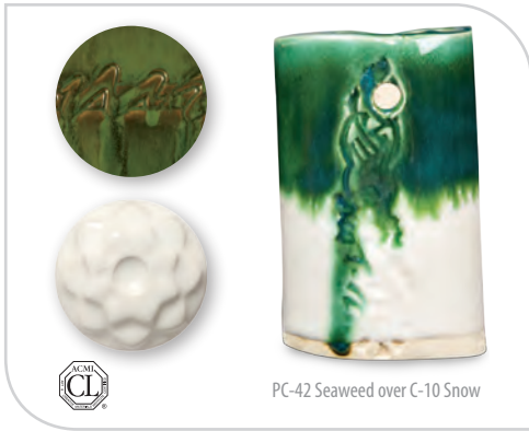
PC-42 Seaweed over C-10 Snow