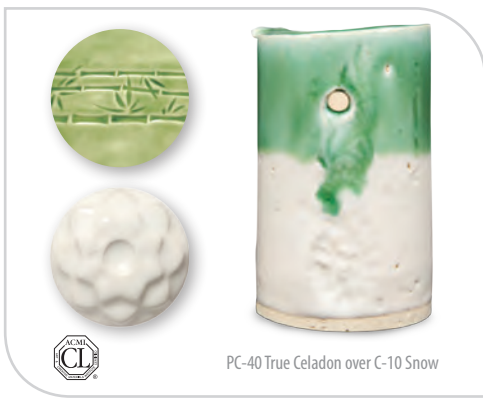
PC-40 True Celadon over C-10 Snow