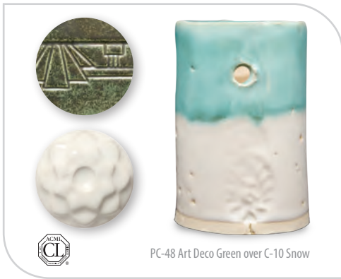
PC-48 Art Deco Green over C-10 Snow