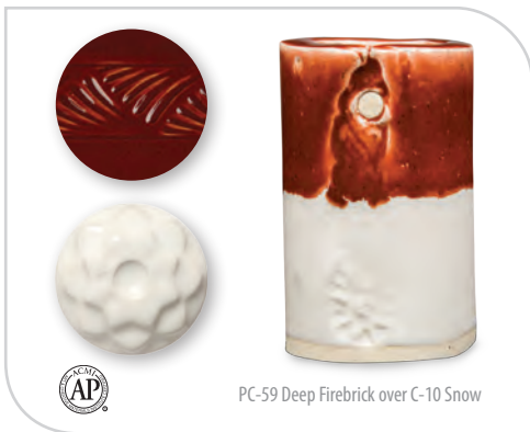
PC-59 Deep Firebrick over C-10 Snow