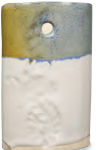
PC-28 Frosted Turquoise over C-10 Snow