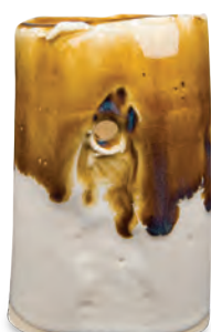
PC-33 Iron Lustre over C-10 Snow