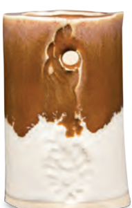
PC-37 Smoked Sienna over C-10 Snow