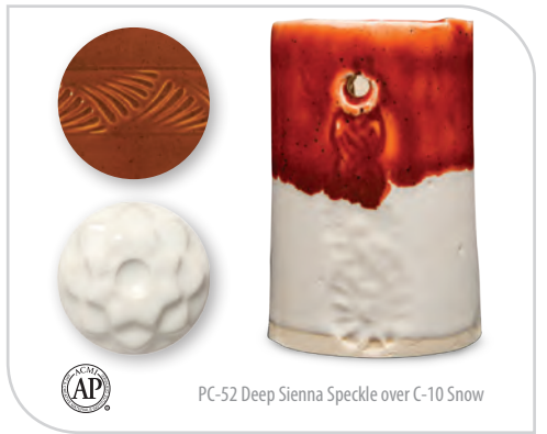
PC-52 Deep Sienna Speckle over C-10 Snow