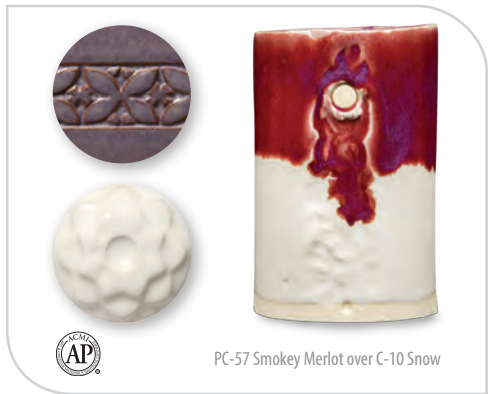
PC-57 Smokey Merlot over C-10 Snow