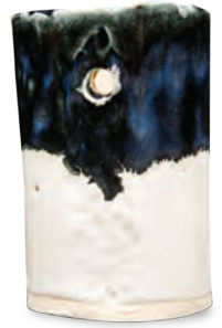
PC-12 Blue Midnight over C-10 Snow