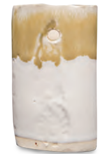
PC-32 Albany Slip Brown* over C-10 Snow